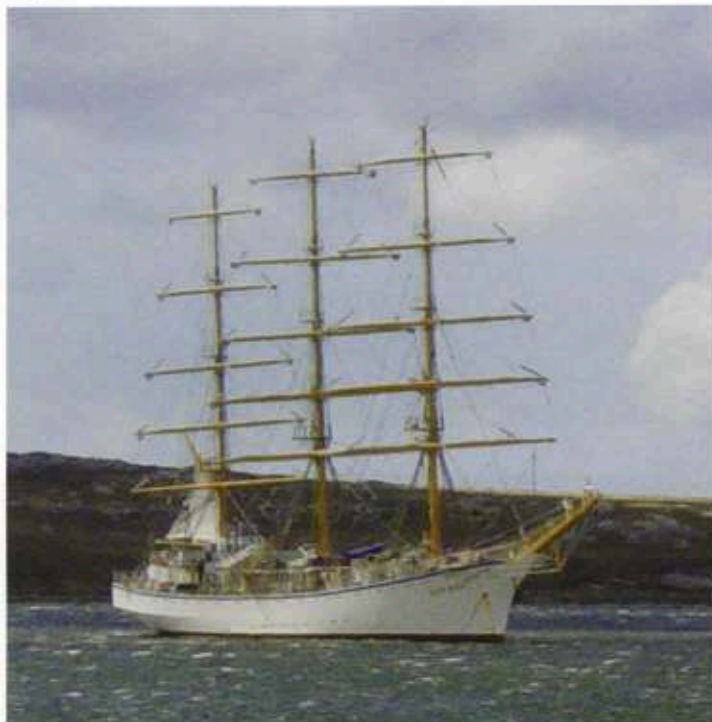
The Russian training ship Nadezhda in Stanley harbour.