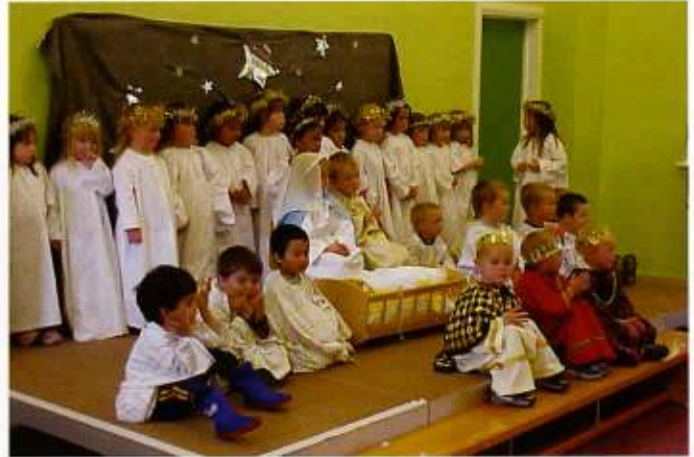
Pre-schoolers at the Infant Junior School nativity play