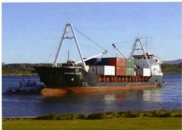
The container ship Marriane Danica aground in Stanley harbour in November. The ship was freed the same day.