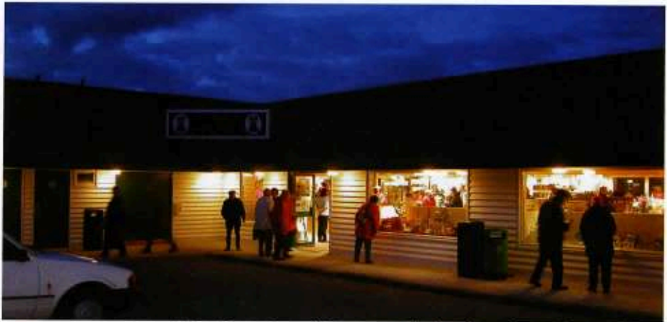
The Capstan gift shop on the harbour front. Seen above open at night for tourists from a visiting cruise ship. Below is its smart interior.