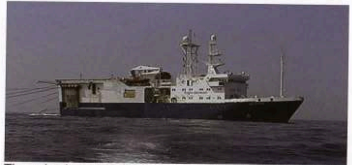
The seismic research vessel Geo Pacific which belongs to the Norwegian company Fugro Geoteam.

Calculations indicate that from 60 to 110 billion barrels of oil may have been generated and expelled from the mature