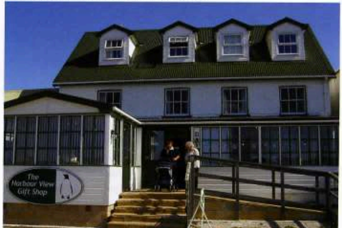
Another smart new development on the harbour front: The Harbour View Gift Shop .