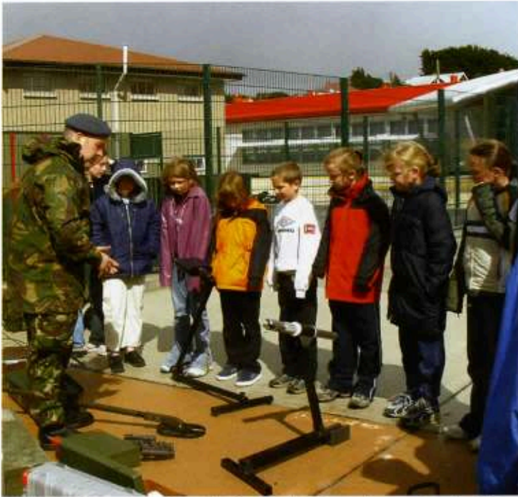
Children from the Infant Junior School receive a mine briefing from the Explosive Ordnance Department. Mines and other dangerous leftovers from the 1982 war continue to be found regularly, including a bomb found recently at Stanley Airport.