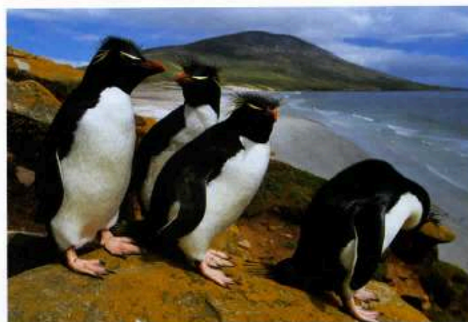
One of the stunning pictures of Falklands wildlife in Kevin Schafer's new book - Rockhopper penguins.