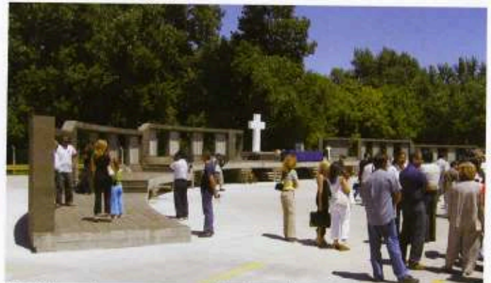
The Argentine monument for Darwin partially assembled at Ezeiza airport, Argentina.

Most of it was prefabricated in Argentina and it has been shown to various groups in Argentina at Ezeiza airport, Buenos Aires. Although Prime Minister Blair and British Ambassador to Argentina, Sir Robin Christopher, have pointed out that it is a reconciliatory move by the Islanders, it has so far served only to increase rancour. The Monument was agreed in the Joint Statement of July 14th 1999. This allowed Argentines to enter the Falklands on presentation of their passports (as all other nationalities - including the British - have to do). But Defence Minister Jose Pampuro and Argentine Foreign Minister Rafael Bielsa have both stated that they will not attend the inauguration if they have to have their passports stamped. In other words they appear to be seeking a concession to Argentine sovereignty claims.