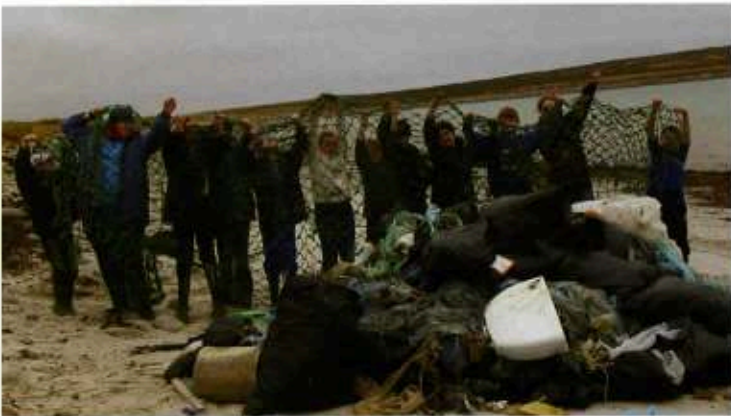
The Falklands Conservation Watch Group celebrate another beach clean up.