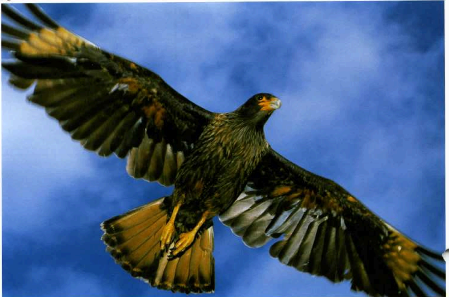
A Striated Caracara in flight. One of the many stunning images of the Falklands in Kevin Schafer's new book on Falklands wildlife: The Falkland Islands: Between the Wind and the Sea (See Review Page 18).