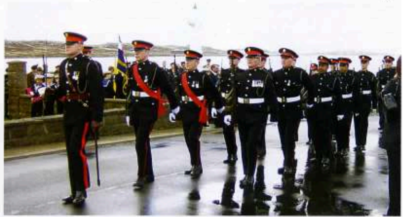
Battle Day: Above: The Falkland Islands Defence Force parade for Battle Day at the 1914 Battle Monument, in rainy weather.