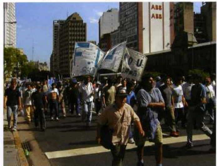
Pickets on the march in Buenos Aires in December.

Groups of unemployed Argentines still plague Buenos Aires and other Argentine cities blocking roads and causing trouble. President Kirchner has come in for considerable criticism for his unwillingness to allow the police to use force to stop them.