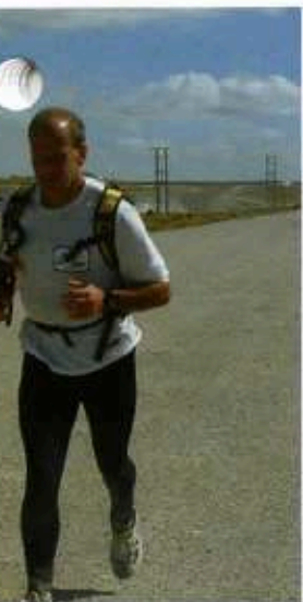
Falklands. Shown above is Sir Ranulph, a military adviser, who ran the Seven Marathons Seven Islands challenge in 2003. He completed the challenge in 7 days and a half hours. Crowds lined the finishing line in Stanley.